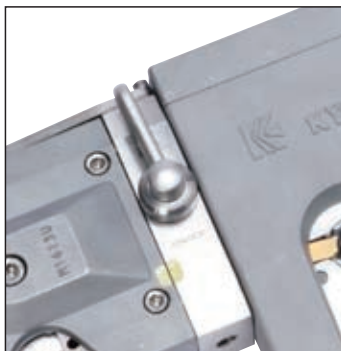
KIKK one touch lock