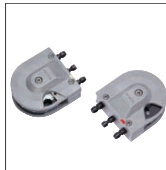
Setter,Revolver type magazine

*Specification and design are to be changed without notice for improvement.Movie is available on Kyokutoh web page.